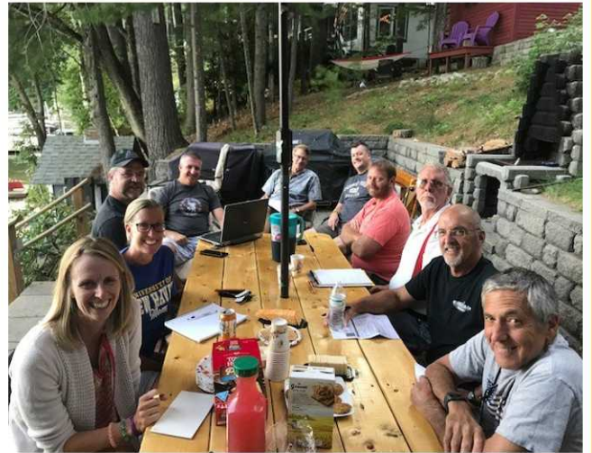
August 2019 Board Meeting